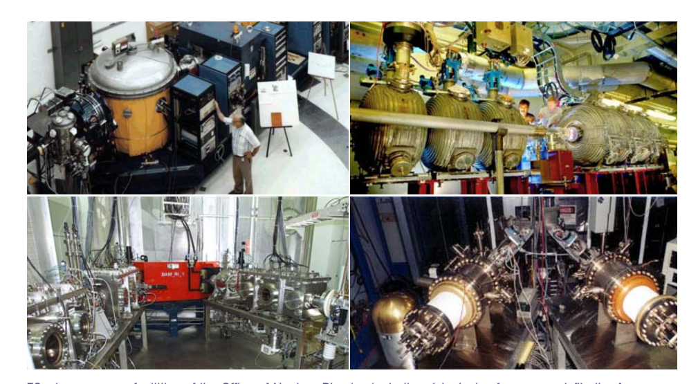
ESnet serves user facilities of the Office of Nuclear Physics including (clockwise from upper left): the Argonne Tandem Linac Accelerator System (ATLAS) at Argonne National Laboratory, the Relativistic Heavy Ion Collider (RHIC) at Brookhaven National Laboratory, the Continuous Electron Beam Accelerator Facility (CEBAF) at Jefferson Laboratory, and the Holifield Radioactive Ion Beam Facility (HRIBF) at Oak Ridge National Laboratory.